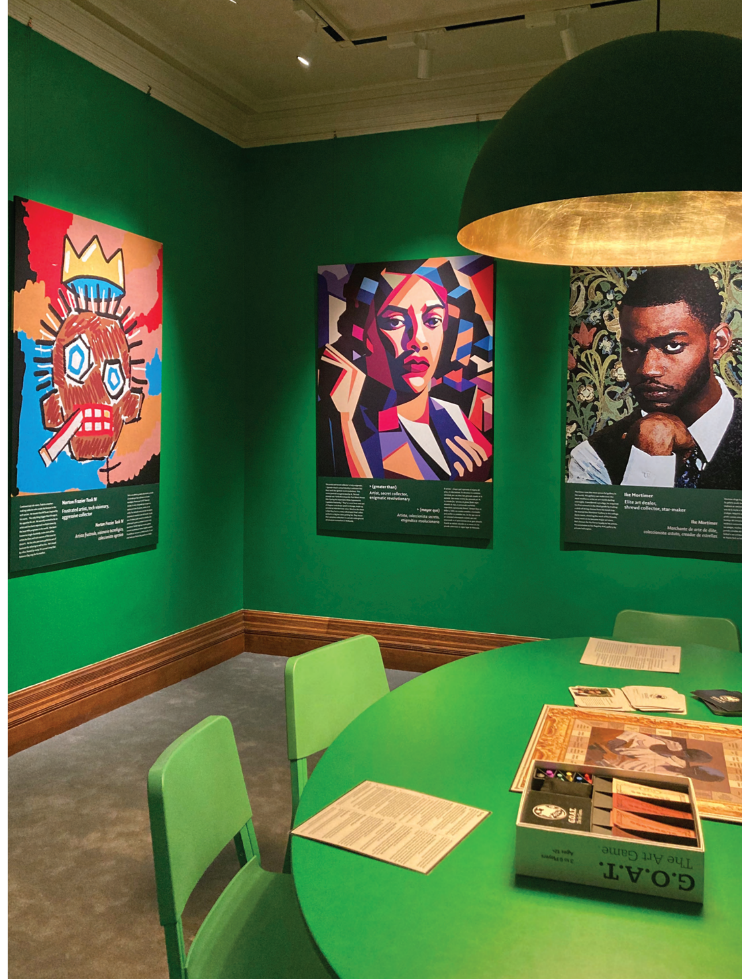
Installation view, DARNstudio, G.O.A.T. The Art Game , 2023 The Ballantine House, The Newark Museum of Art, 2023