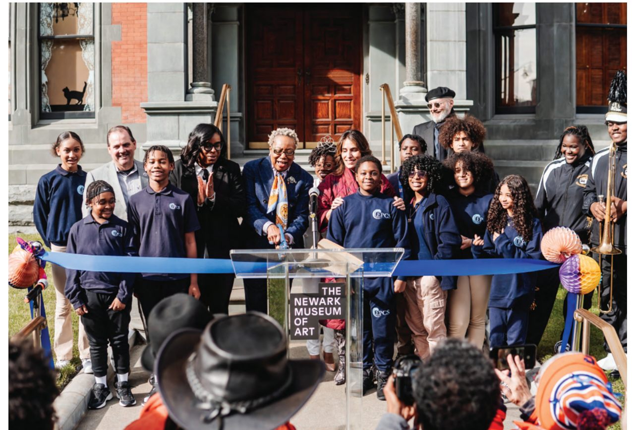
The Ballantine House reopening ribbon cutting, November 2024.